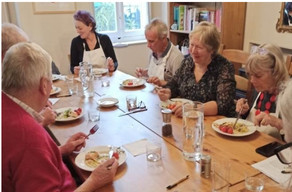
Healthy Eating Workshop