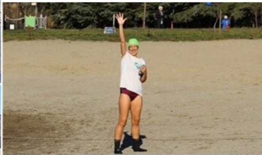
Cold Water Knees-up