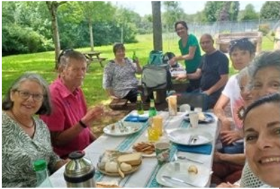
Tarn social picnic