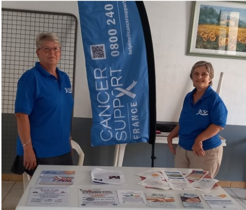
Forum des Associations