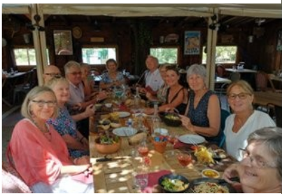
Aude Est lunch