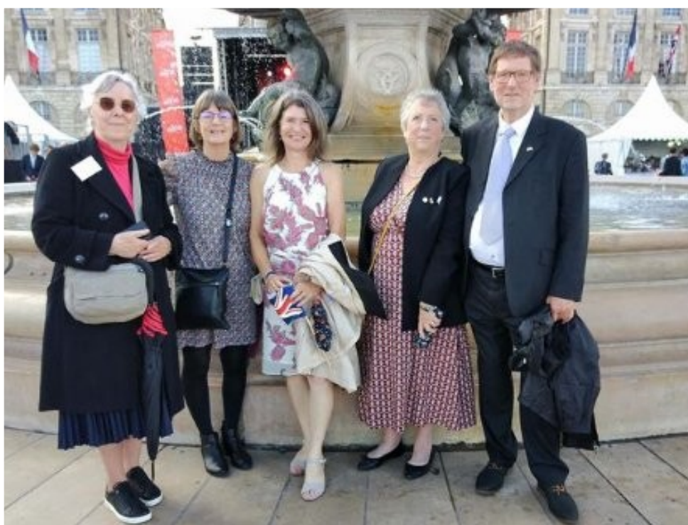
CSF Ouest Aquitaine Bureau at the event in Bordeaux attended by the King and Queen

We will shortly be putting together our autumn and winter event plan and will circulate this as soon as possible to our members. One date for your diary is Saturday 25 November for our Christmas Fayre.