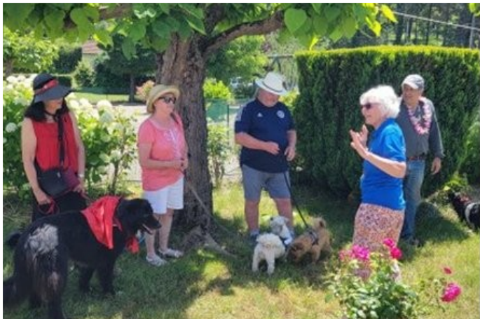
A fun-day Dog Parade