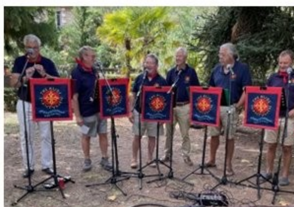
Enjoying a very pleasant and relaxing Bien-être/Well-being Day