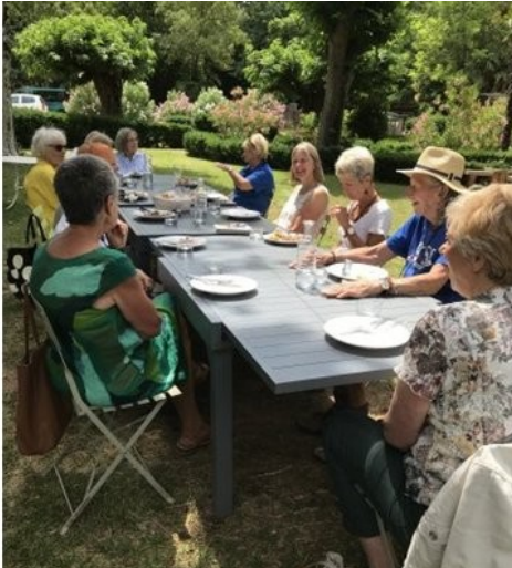
Aude & Ariège Active Listener event