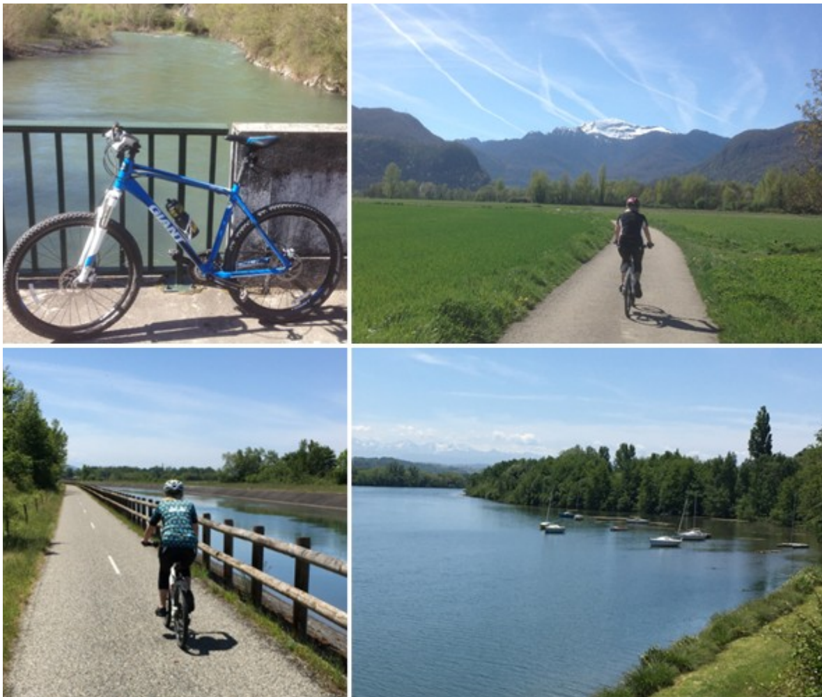
Just some of the stunning views along the route

Based on previous events, we usually cycle at an average speed of 13-14 kph. A Mountain bike / VTT would be preferable to a road bike. You don't have to ride every day of the event to participate.