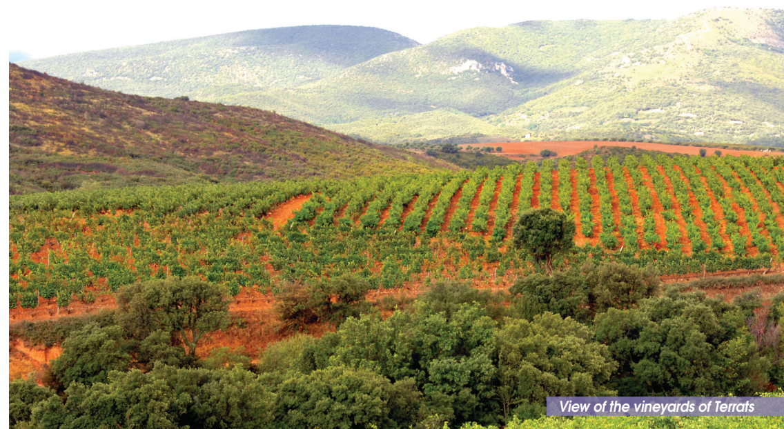
View of the vineyards of Terrats