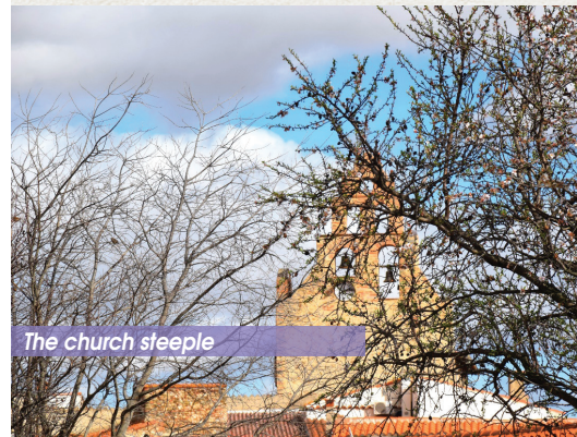
The church steeple

This church is dedicated to Saint Julian and Saint Baselisse, both highly venerated in Roussillon, who would have refused to consummate their marriage to spread the Christian faith on their own. It is a Romanesque church from the 11th or 12th century