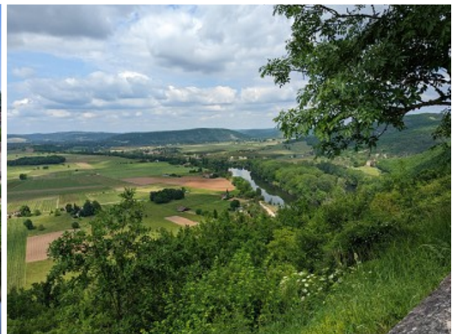
From a cycle route overlooking the Lot valley from Bélaise