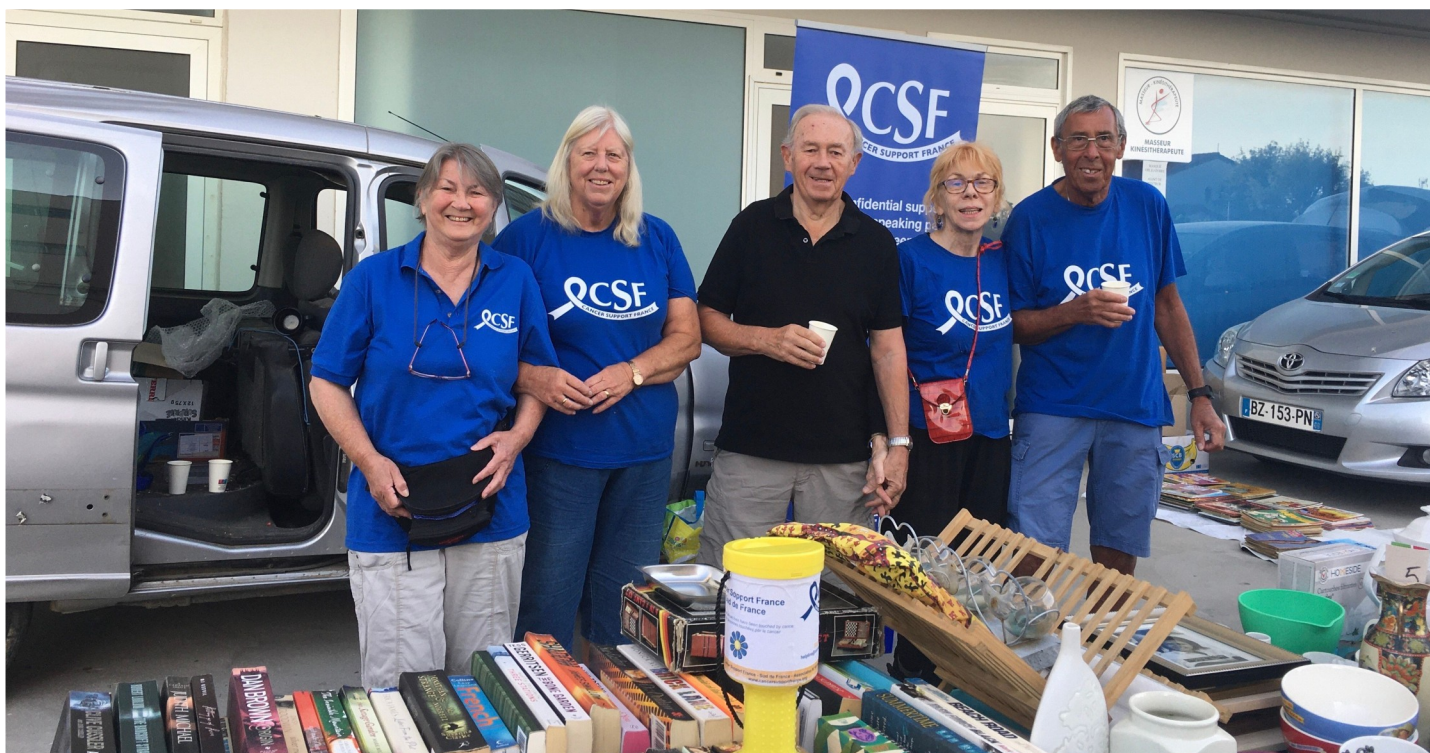
Sud de France vide-grenier 2022