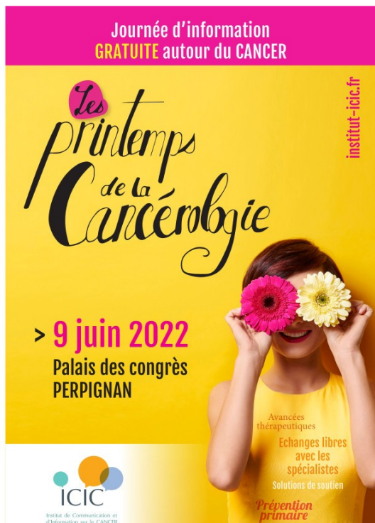
Sud de France ICIC Printemps, Perpignan