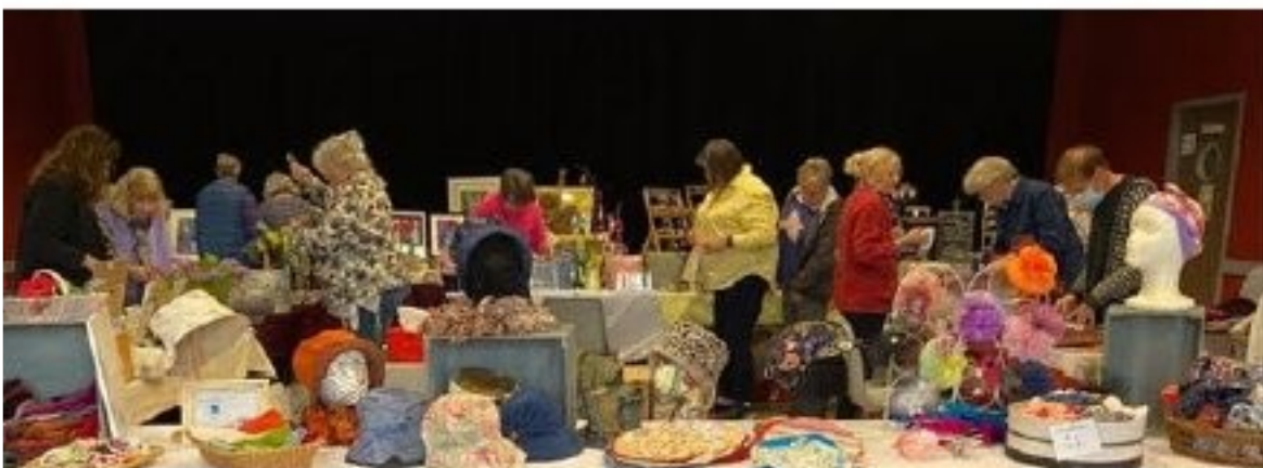
A selection of some of the 29 stallholders and the vast array of items for sale