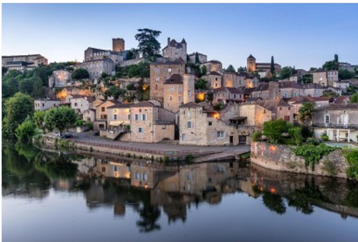
Beautiful Puy-l'Évêque reflected in the river Lot

If you would like to have more information please email me at: - lot-membership@cancersupportfrance.org